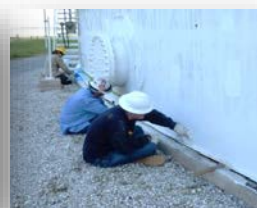
Preparation of the Tank Chime