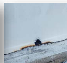
Installation of UT Scan Ports on Problematic Areas of Tank Chime