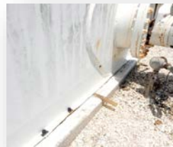
Installation of UT Scan Ports and Coupon Ports