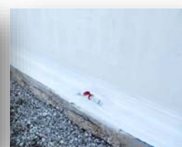
Finished Installation of Zerust IDS with Inhibitor Sleeves