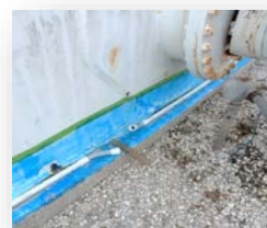
Installation of the “Chime Ring Dry” IDS PVS Pipes