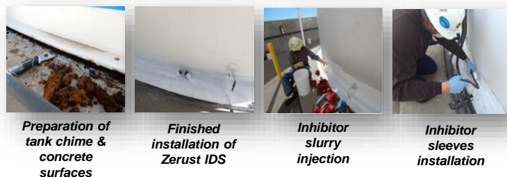
Preparation of tank chime & concrete surfaces