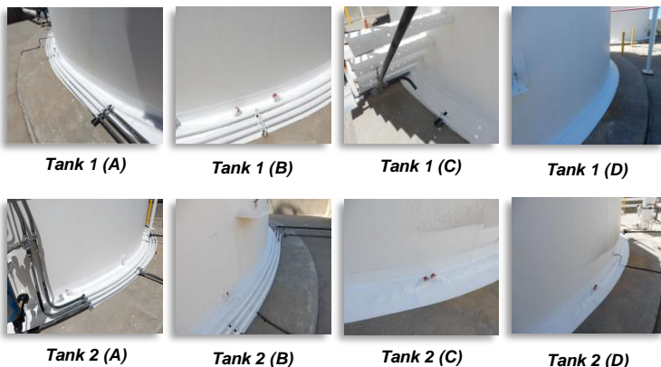
Tank 1 (A)