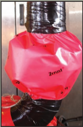
Offshore Platform - Fire Water Line