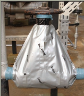
Coastal Terminal - Oil line with Gate Valve