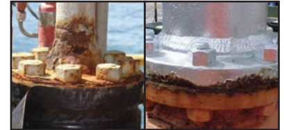
Taping does not protect the nuts and bolts or welded necks