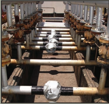
Inland Terminal - Oil Lines