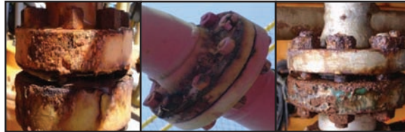
Crevice corrosion and weakened welds can lead to product leakage, while frozen fasteners will require time consuming maintenance